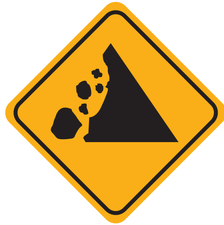
Watch for Fallen Rock Sign