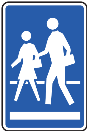
School Crossing Sign