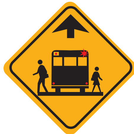
Hidden School Bus Stop Ahead Sign