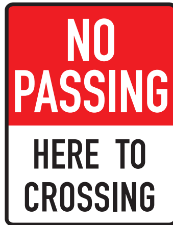
No Passing for Crossover Zone Sign