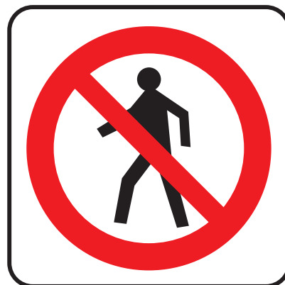
No Pedestrians Allowed Sign