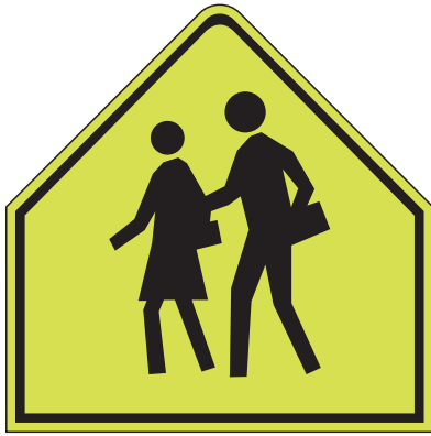
School Zone Sign