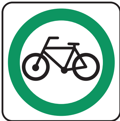
Bicycle Route Sign