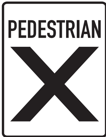
Pedestrian Crossover Sign