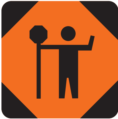
Traffic Control Person Ahead Sign