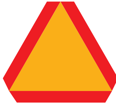
Slow Moving Vehicle Sign