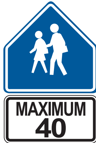
School Zone Sign