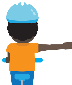
Alternative Right Turn: Right arm out