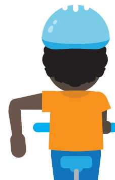
Stop: left arm out, down, palm back