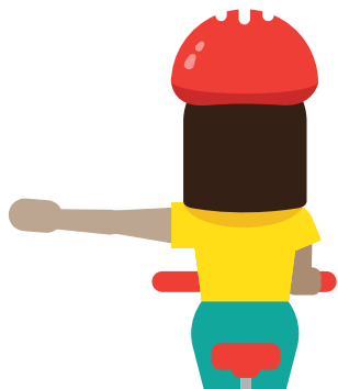
Left Turn: Left arm out